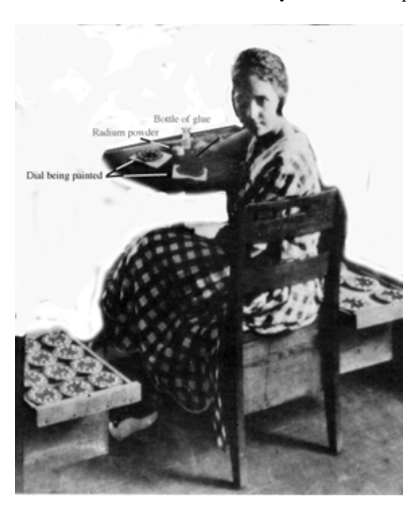
Close-up of the workshop, this one in Ottowa, Ill. (Courtesy Argonne National Lab).

Nobody knew it was harmful, except the owners of the U.S. Radium Corporation and scientists who were familiar with the effects of radium. Those days, most people thought radium was some kind of miracle elixir that could cure cancer and many other medical problems.