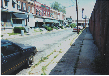
dunham street before