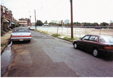
dunham street after