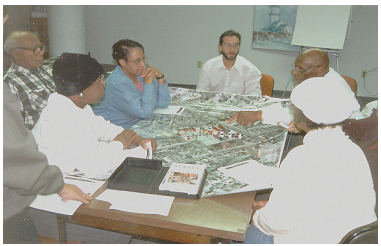
ncia and isles meeting